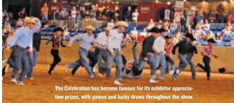
The Celebration has become famous for its exhibitor appreciation prizes, with games and lucky draws throughout the show.