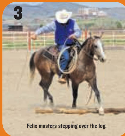
3 Felix masters stepping over the log.