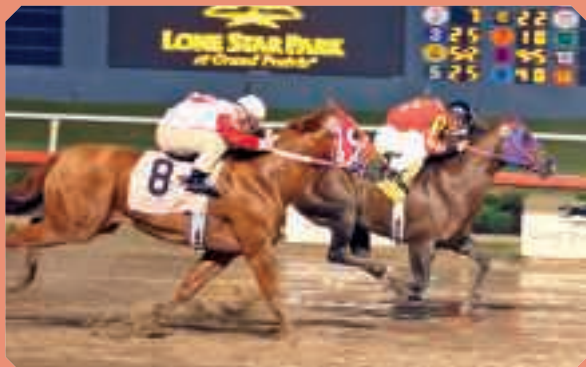
LONE STAR PARK

Streakin Cherry broke fourth and quickly made his way to the lead. The sorrel gelding beat favorite Noconi by a half length. This is the second stakes win for the gelding who won the All American Gold Cup (G3) in September.